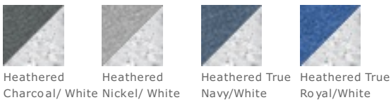
Heathered Charcoal/ White Heathered Nickel/ White Heathered True Navy/White Heathered True Royal/White